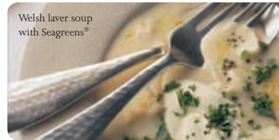
Welsh laver soup with Seagreens®

Recommended daily intake: normally 2 x 500mg capsules or 1g granules (quarter teaspoon); less for children, more in pregnancy, physical training or recuperation, and under professional guidance in detoxing, chronic health conditions and during treatment; best taken early every day with food.