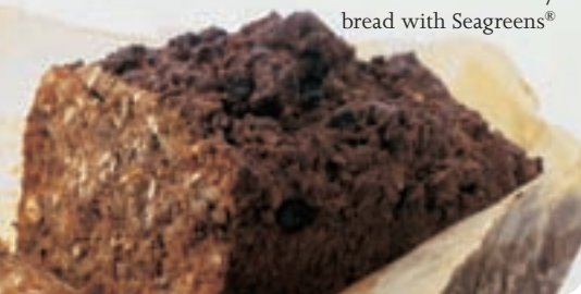
Swedish whortleberry bread with Seagreens®

"Using it instead of salt the loaf rises as well if not better...3.5 per cent sodium against 40 per cent in salt"