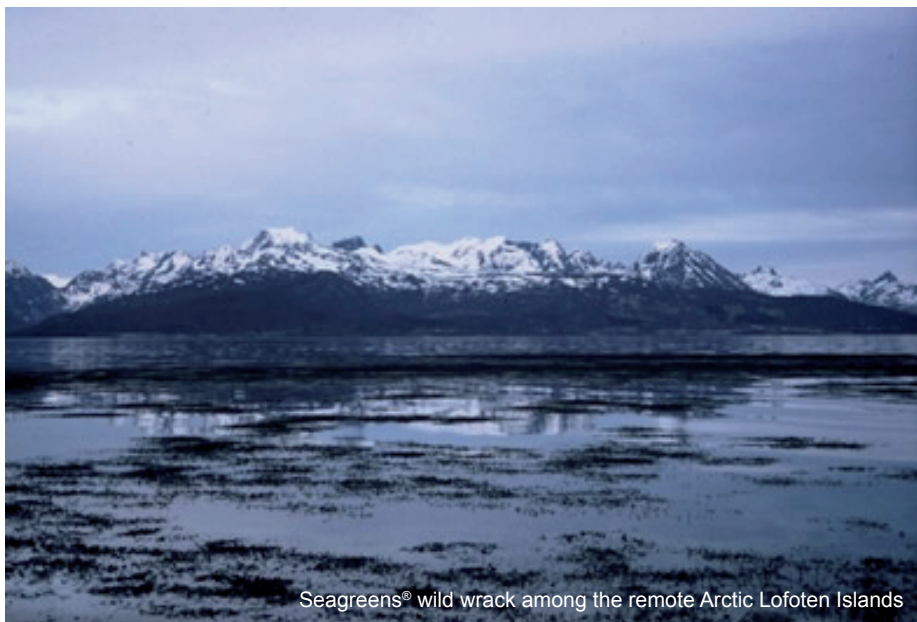
Seagreens® wild wrack among the remote Arctic Lofoten Islands

difference on a daily basis to the balance of a western diet, but only last year I discovered that the traditional Japanese daily intake in 1964 (the last statistical data) was four and a half times this amount, and they had the lowest incidence of cancers and cardiovascular diseases.[4]